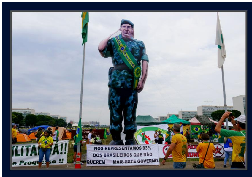
Figure 2 – Inflatable General Mourão (November 2015)

One of the immediate results of this dynamic became evident in the pro-impeachment demonstrations against President Dilma Rousseff and pro-military intervention protests in 2015. Amidst these protests, it was possible to see an inflatable figure of General Mourão dressed in uniform and with a presidential sash on the lawn of the National Congress. Next to the figure, the same protesters simulated the funeral of Lula and Dilma (ÉBOLI, 2015) - see figure 2.